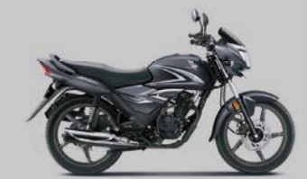
MATTE AXIS GREY