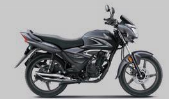
GENY GREY METALLIC